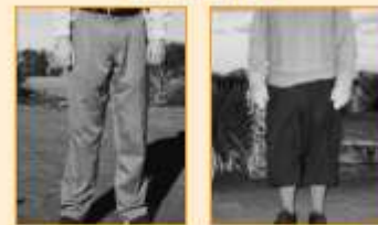
PANTS PLUS FOURS