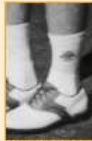
GOLF CLUB LOGO