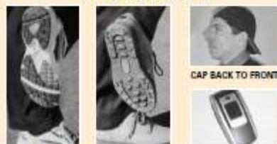
JOGGERS CASUAL MOBILE PHONE