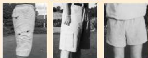
CARGO TOO LONG TOO SHORT