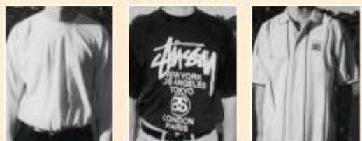
NO COLLAR EXCESSIVE LOGO HANGING OUT