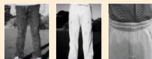
DENIM/JEANS CARGO ELASTIC WAIST