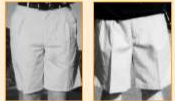
TAILORED CUFFED SHORTS