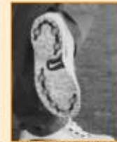
SPORT - GOLF SHOE